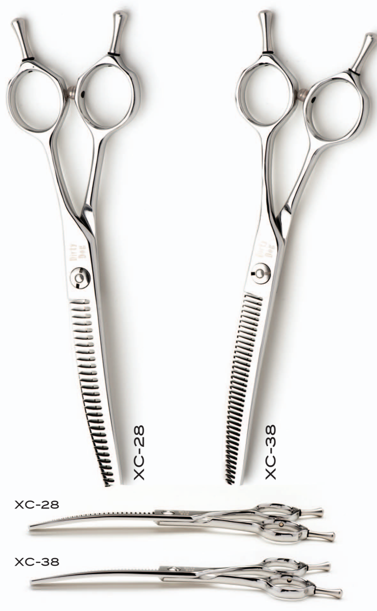
XC-28 / XC-38: $299 EACH CHINA - FORGED: 440C - JAPANESE STEEL STRAIGHT HANDLES PERFECT FOR FLIPPING SHEARS XC-28 & XC-38 ARE 6.5" LENGTH