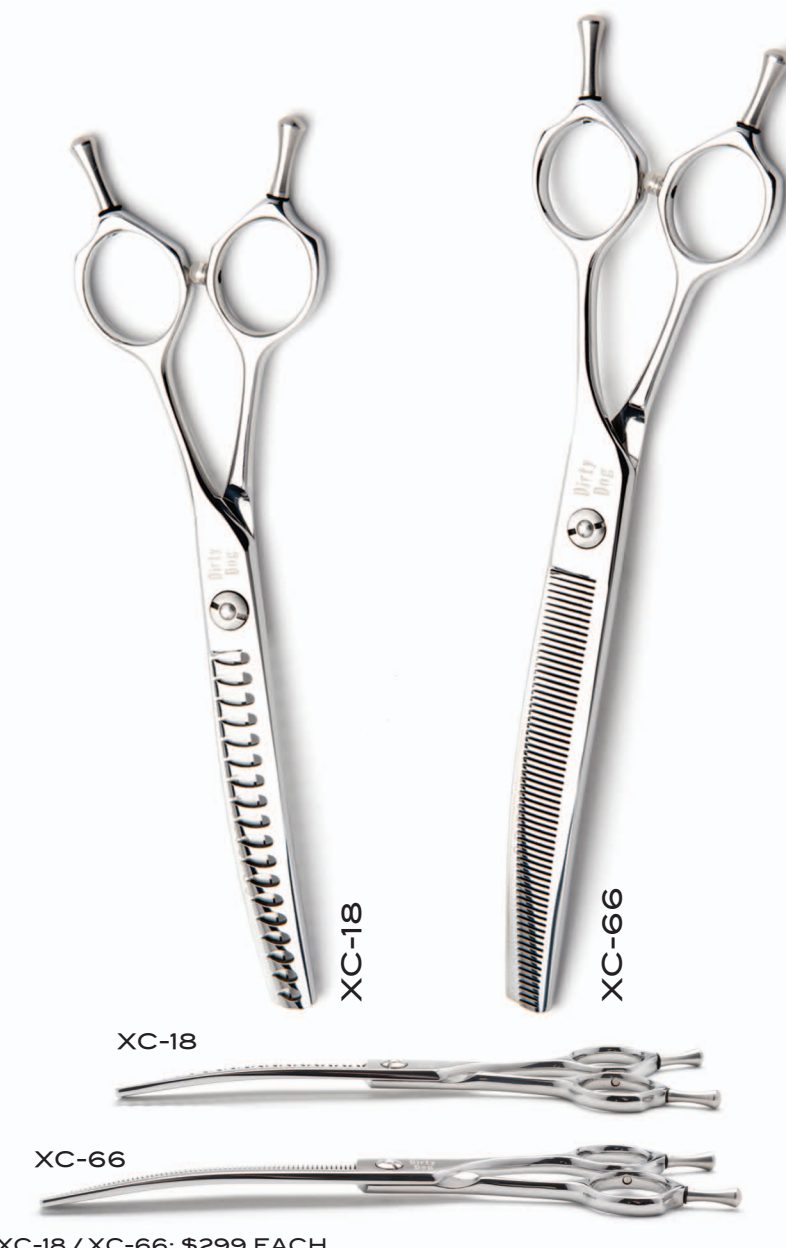
XC-18 / XC-66: $299 EACH CHINA - FORGED: 440C - JAPANESE STEEL STRAIGHT HANDLES PERFECT FOR FLIPPING SHEARS XC-18 IS 6.5" LENGTH. XC-66 IS 7.25" LENGTH